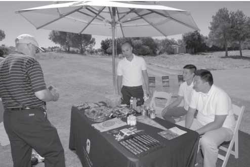
PUC Sponsorship Table

golf Classic coordinator, MVA’s annual Golf Classic had over 40 golfers gather at San Jose’s Silver Creek Golf Country Club Monday, August 26.